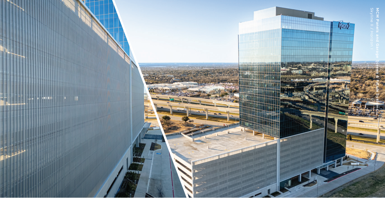
MCM Panels and Garage Screen & Etcade Systems Skyline II / Horizon I