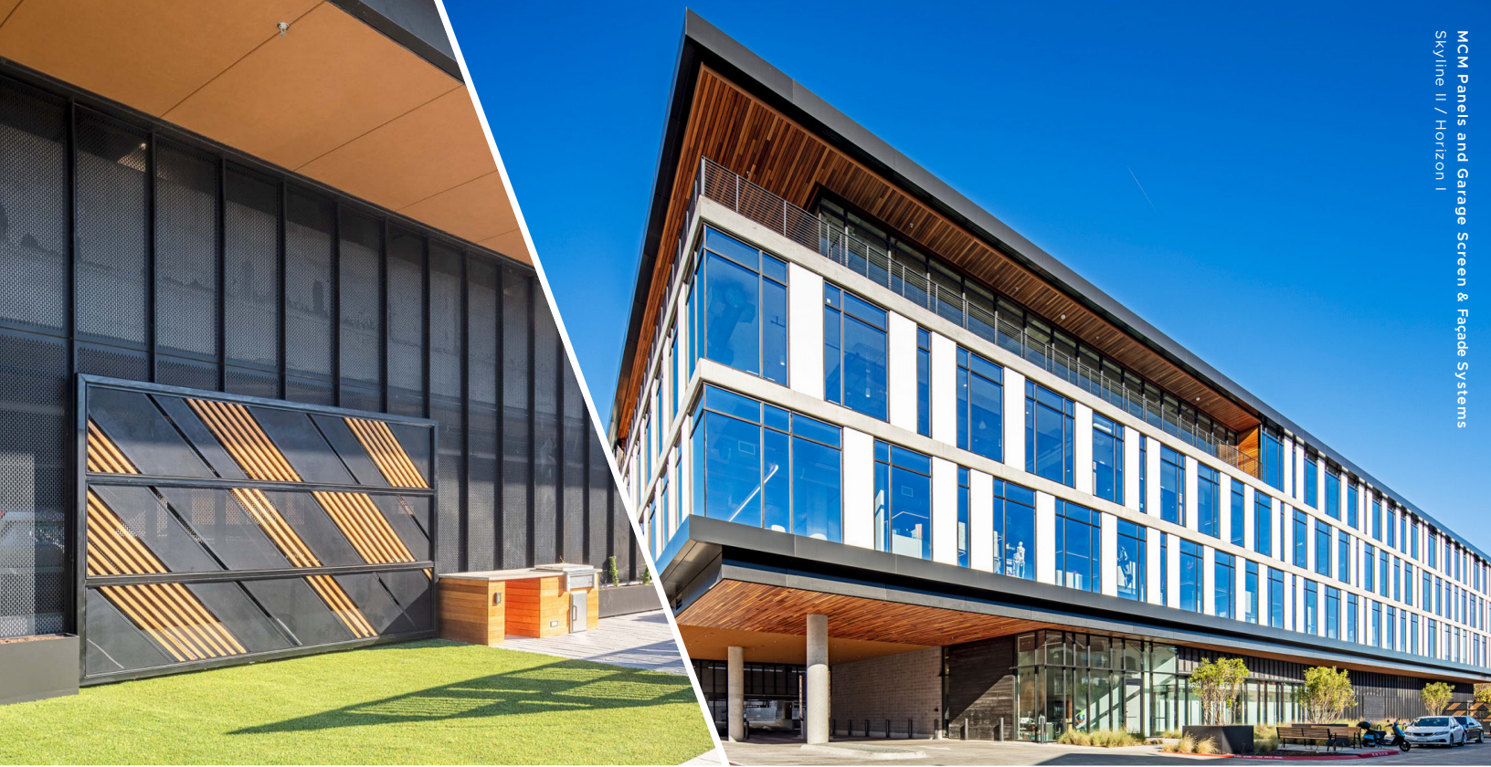
MCM Panels and Garage Screen & Façade Systems Skyline II / Horizon I